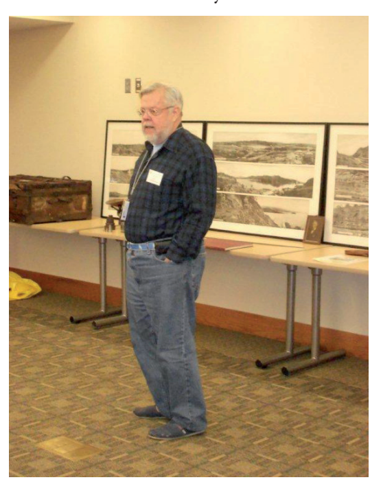
David Burt's Panama Canal pictures