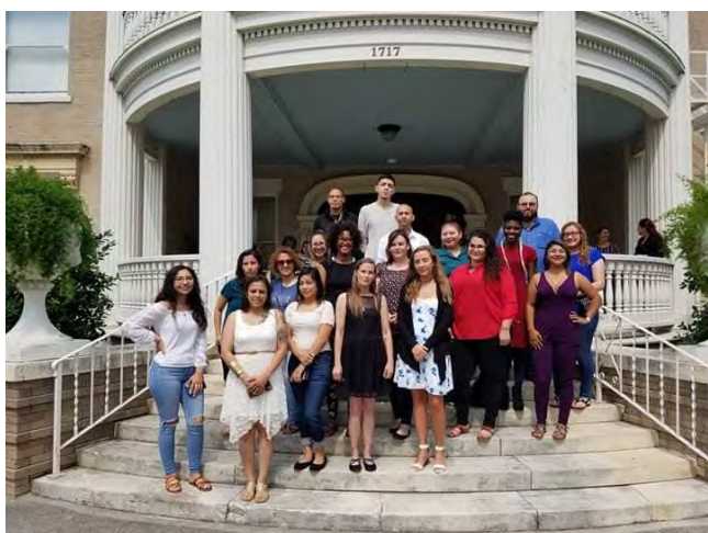
Students were all smiles at their graduation luncheon.