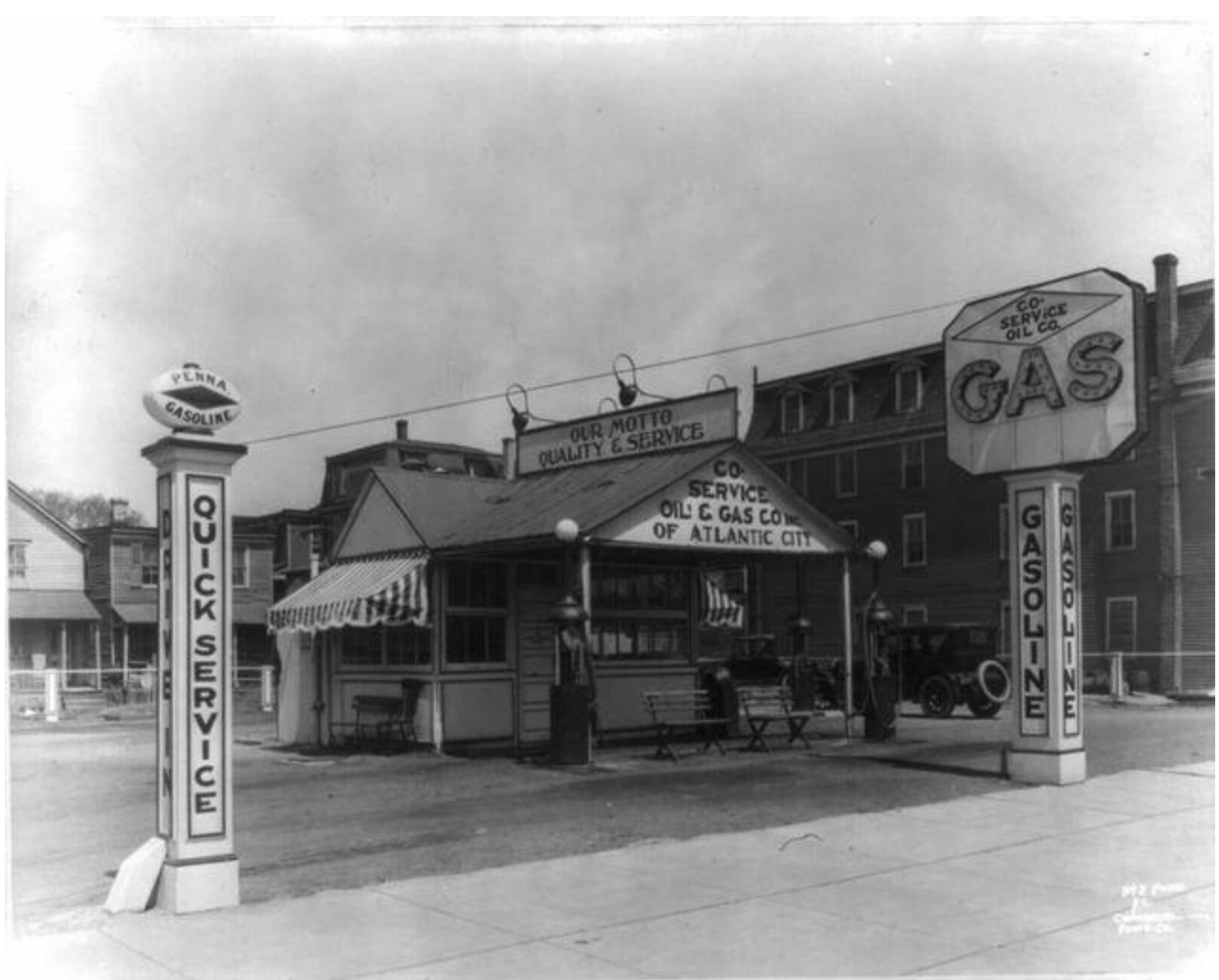
Atlantic City - year Unknown