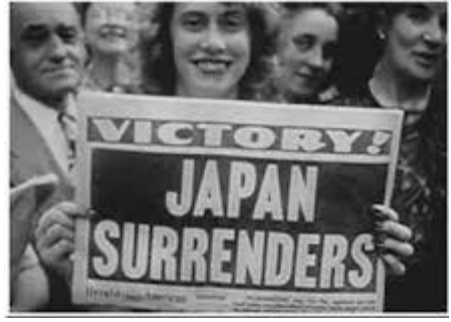
VJ Day September 2nd

Betcha Didn't Know No piece of paper can be folded in half more than seven times