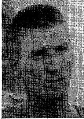
TIM McVEIGH ... Did he have a double?

Who was masquerading as Timothy McVeigh just prior to the bombing?