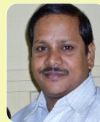
Dr. Laxmikant Yeragi Vikas College, Vikhroli, Mumbai