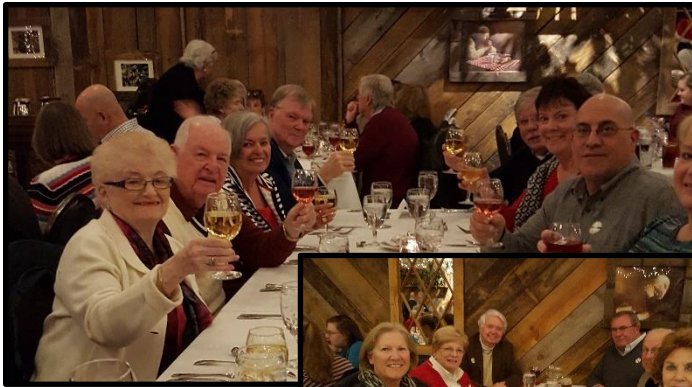
LEFT: Parishioners enjoy a glass of wine at the Duplin Winery Dinner and Christmas Show! Everyone had a great time!