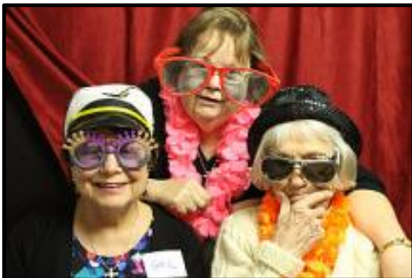
Anyone know these wacky women who were cutting up in the photo booth at the RSVP (Retired Senior Volunteer Program) Volunteer Thank You Dinner ???