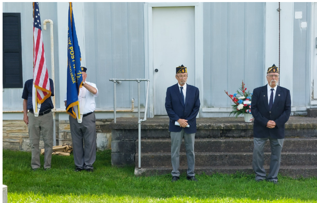
Shiloh Cemetery May 30th