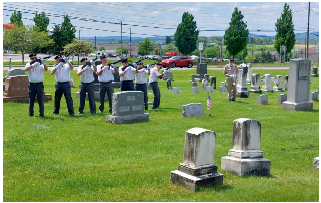
Shiloh Cemetery May 30th