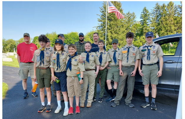
The Boy Scouts came out on May 28th to help put small flags on the graves.