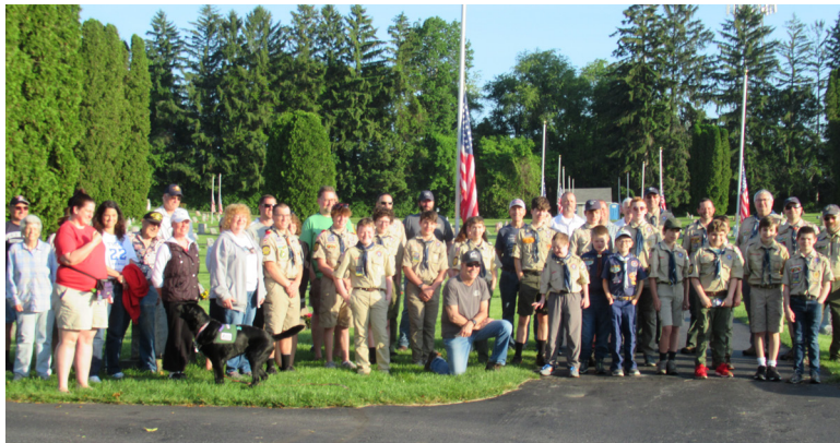
Everyone who came out to the ceremony on May 29th to put the flags up to full staff.