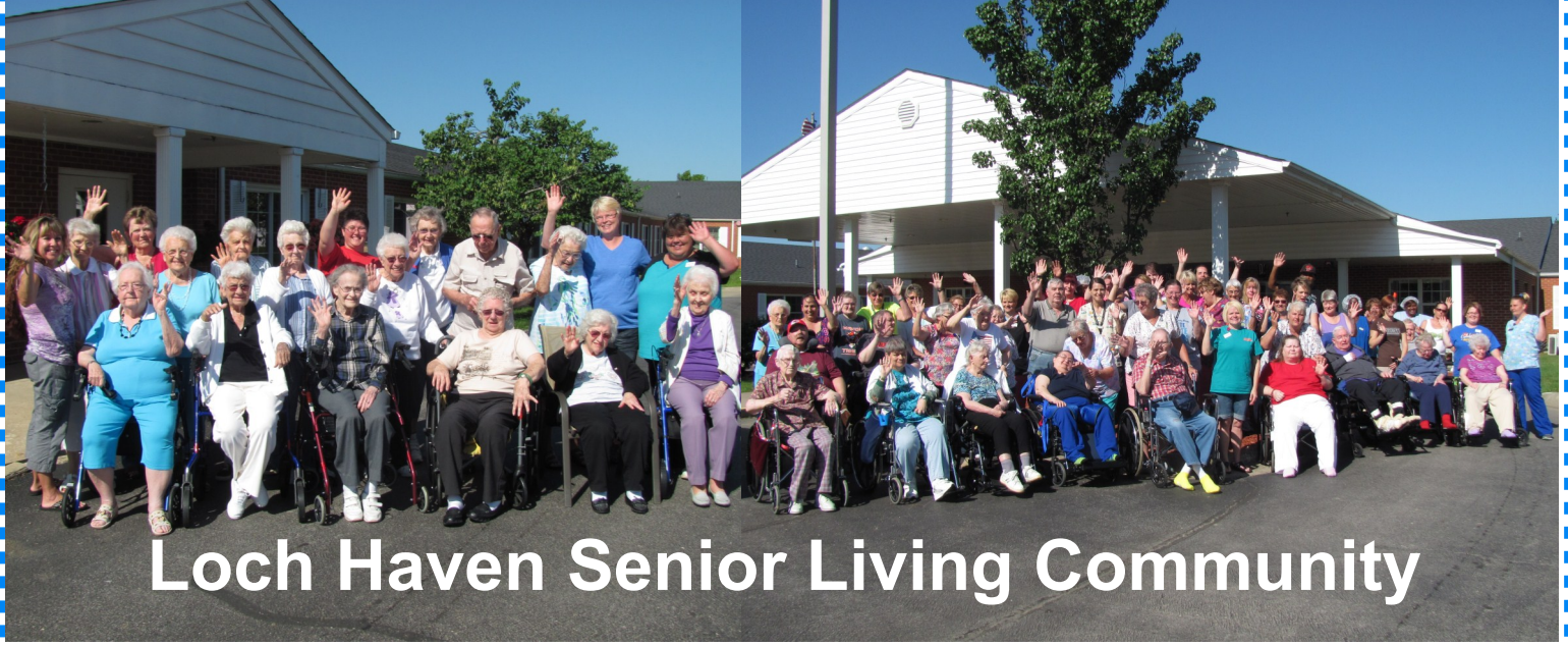
Loch Haven Senior Living Community