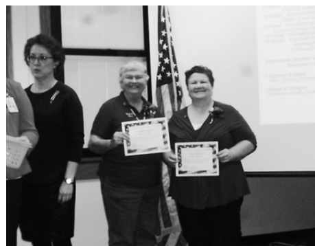
"The Quivira Crossing chapter of The Daughters of the American Revolution presented all of us with Certificates of Recognition and a Remembrance Coin along with some great door prizes"