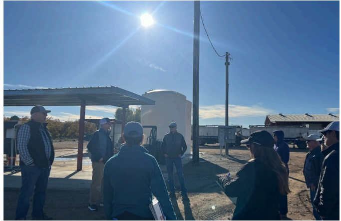
Four Corner Farmland Trust Field Visit

On November 18th, 2024 STWEC staff organized a sub-watershed tour to showcase Shasta and Tehama producer's nitrogen management practices and irrigation efficiency practices to Regional Waterboard. It's important to improve your irrigation efficiency practices as well as your nitrogen management practices to protect ground water quality.