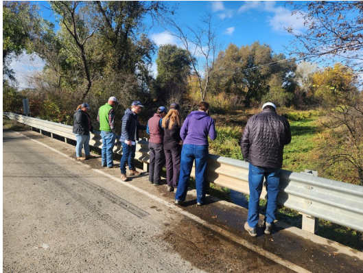
Anderson Creek Monitoring Site Visit

The Anderson Creek monitoring site was also a stop on the tour where staff from Larry Walker and Associates spoke to the efforts of STWEC members where the site typically produces no concerns of nitrogen runoff.