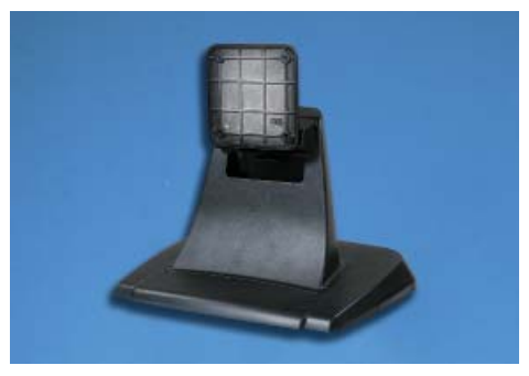
The SPT-4700's Sturdy Base is Easily Removed and Replaced with a VESA Wall Mount Bracket