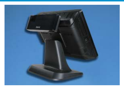
Optional Integrated VFD Customer Display