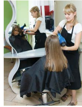
Convenience Stores / Salons