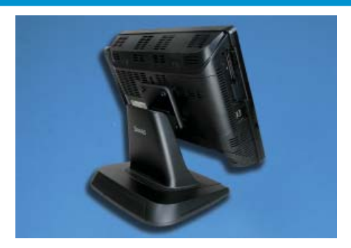
CF Slot is Protected Behind a Convenient, Easy to Access Door