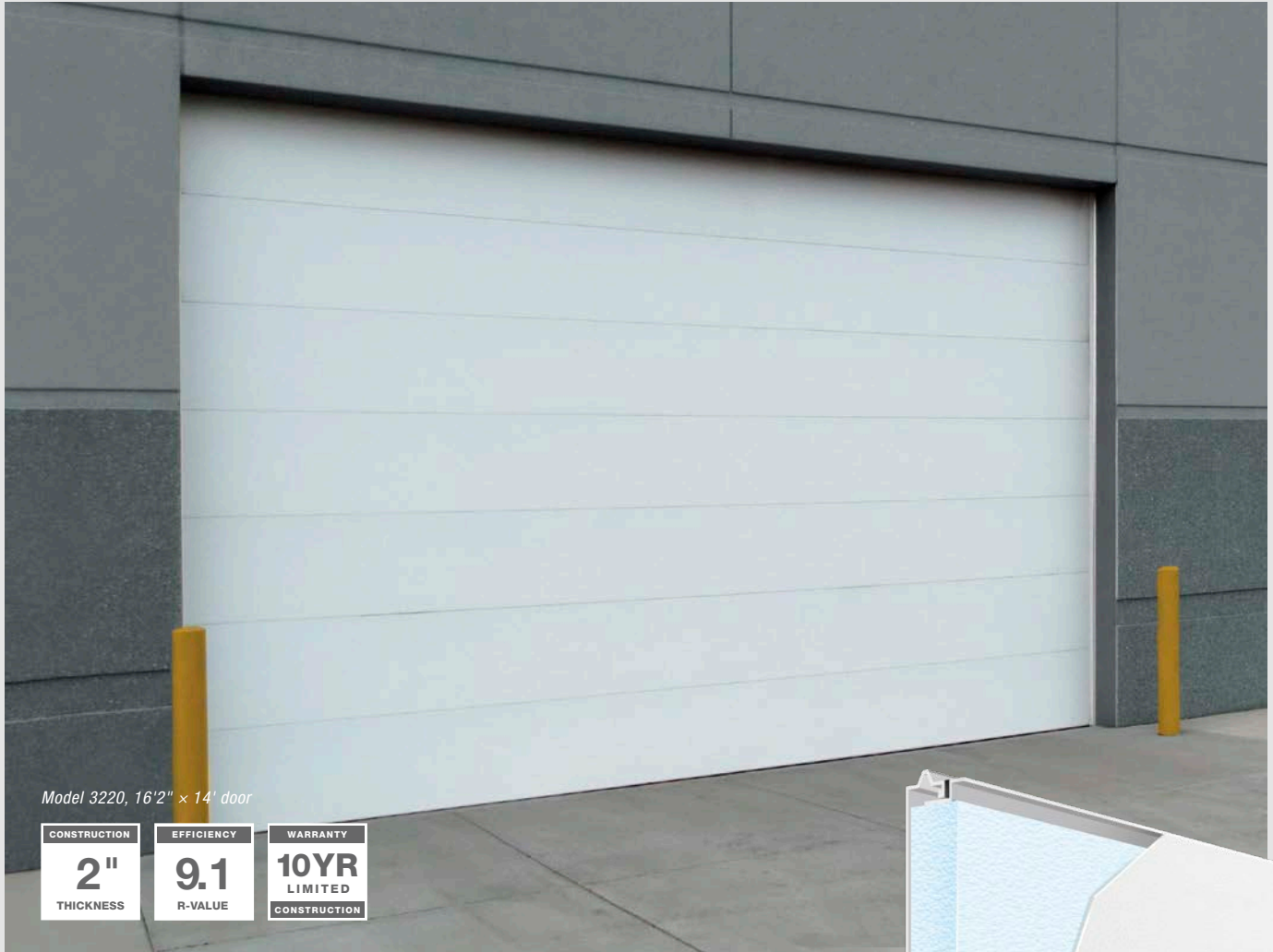
Model 3220, 16'2" x 14' door