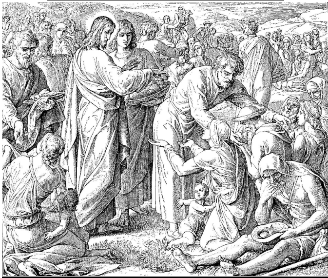
By: The Word Among Us

JULY 27 & 28, 2024 17 TH SUNDAY IN ORDINARY TIME