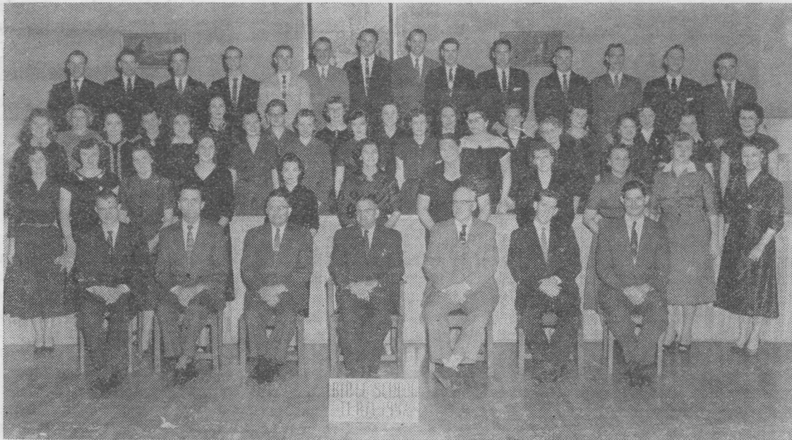
Class of 1957-1958