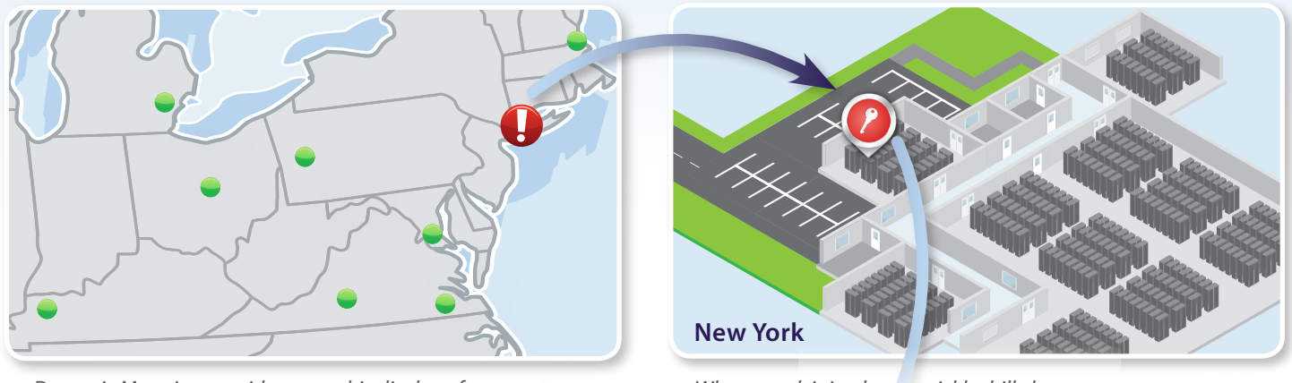
Dynamic Mapping provides a graphic display of your system so you can instantly visualize the security status of your server racks across multiple locations.