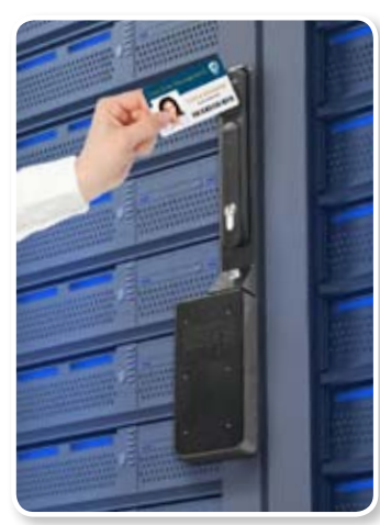
Electronic swing handle includes card reader