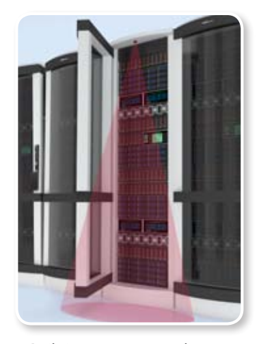
Built-in cameras record keystrokes of user activity