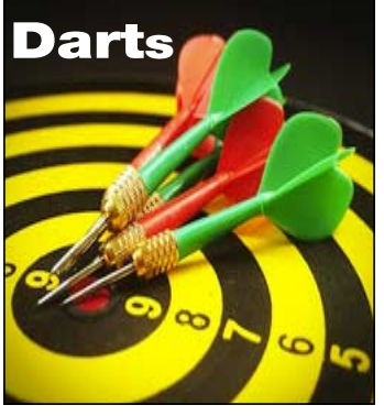
Every Thursday starting at 6:00 p.m.

July 24th - Chili Cheese Dogs 5:00-8:00, Line Dancing 6:00-8:30