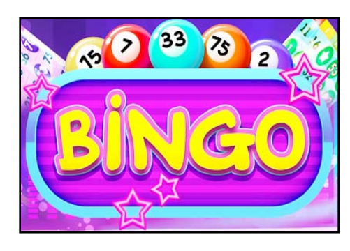
July 5th & 19th 6:30 to 9:00 p.m.

"We shall meet but we shall miss him, there will be the Vacant Chair but though we no more possess him still our hearts his memory bear."