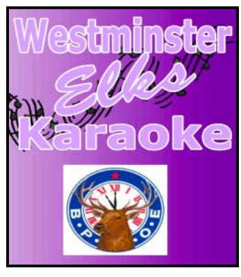
July 7th & 21st 7:30 p.m. to 10:00 p.m.