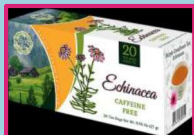
Purple Coneflower Tea (Echinacea) 1.4 oz.