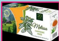
Lemon Balm Tea 1.4 oz.