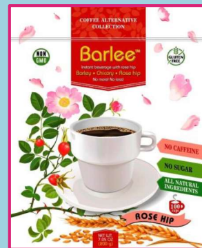
Rose Hip 7.5oz.