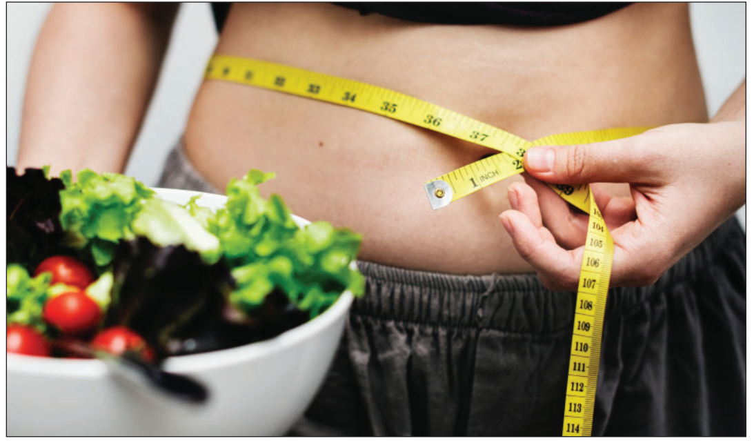
A combination of eating healthy foods and physical activity can enhance your life, as well as help you avoid a variety of lifestyle pitfalls.

"Eating right doesn't have to be complicated," Foroutan says. "Think about what you want your plate to look like and ask if it's incorporating all the major food groups. Select a mix of lean protein foods, vegetables, whole