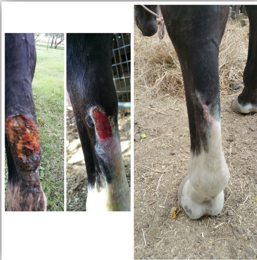
Wound the first day with no laser treatment... progress made after two laser treatments and a week's time.... wound with four laser treatments and 2.5 weeks time.