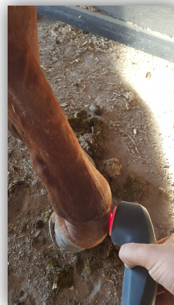
< Cold laser therapy does wonders for different conditions on the lower extremities.

Visit our FB page to see videos, photos and view our schedule!