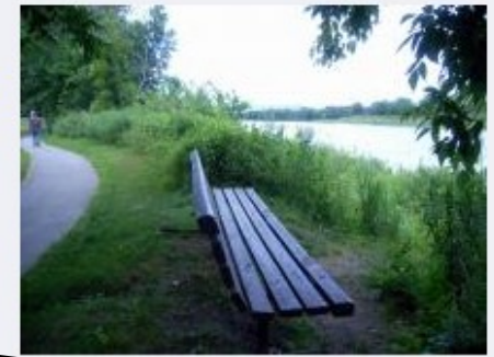
The Riverside Trail by St. John River

The Fort Kent Riverside Trail System is a 3 mile-long recreation trail network along the Saint John River and Fish River through the beautiful downtown Fort Kent. The trail system connects Riverside Park, Fort Kent Blockhouse (a National Historic Landmark), the International Bridge, and the communities. It is open to non-motorized use year-round.