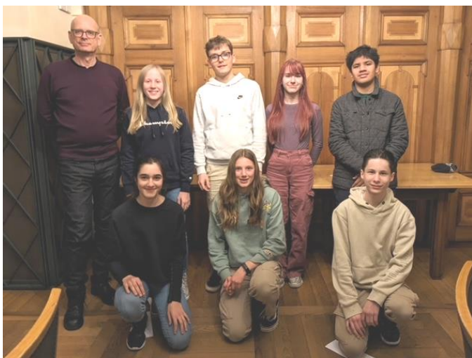
German group without the chaperones