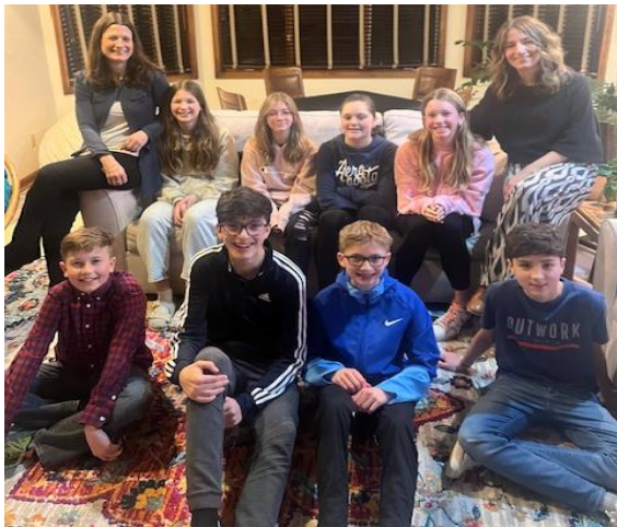
Sheboygan group including chaperones