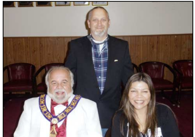
Class named in Honor of P.E.R.s