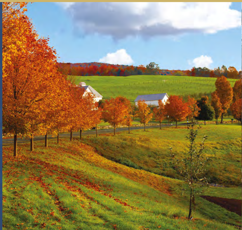
The backroads of Vermont beckon to you

Day Seven – Hampton Inn, Kennebunkport, Maine