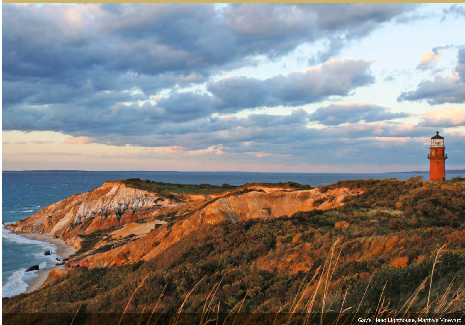
Gay's Head Lighthouse, Martha's Vineyard