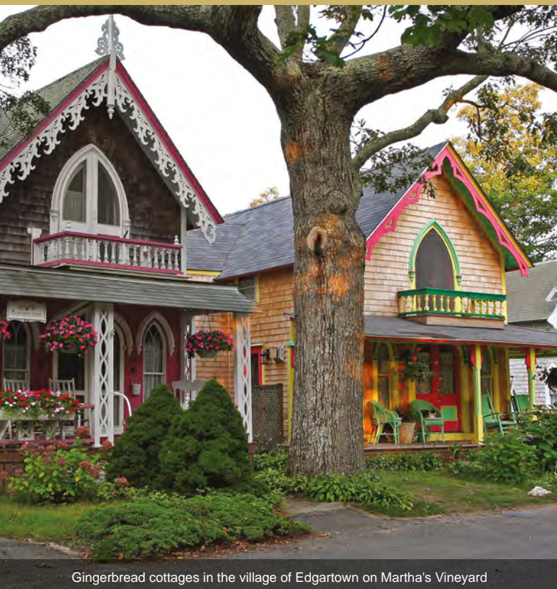
Gingerbread cottages in the village of Edgartown on Martha's Vineyard