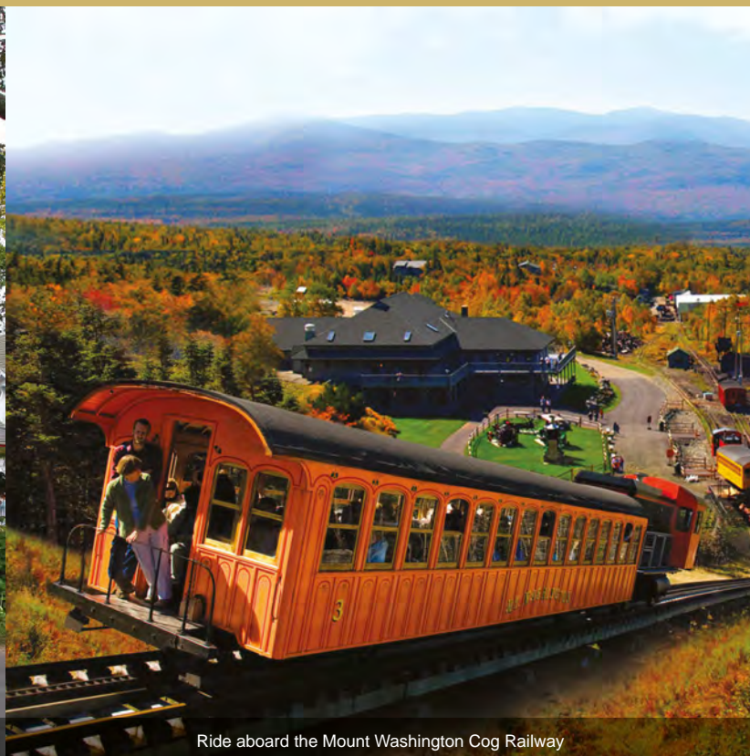
Ride aboard the Mount Washington Cog Railway