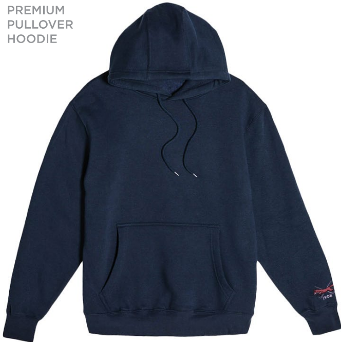
PREMIUM PULLOVER HOODIE