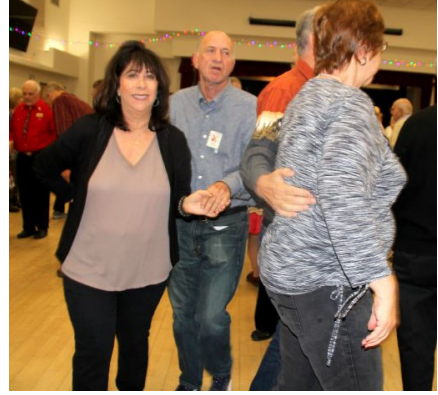
duets and individual styles kept us