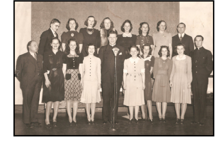
WLLH Radio Broadcast

Throughout the years, in addition to providing music for church services, the choir put on concerts and sang on radio and television.