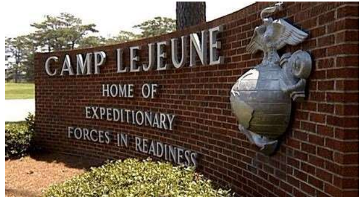
Located near Jacksonville, NC, Camp Lejeune has been home to Marine Corps combat training since its establishment in 1942.

The Camp Lejeune Family Member Program covers out-of-pocket costs for 15 conditions for family members who lived at Camp Lejeune between August 1 st , 1953, and December 31 st , 1987. Information may be obtained online by visiting https://www.clfamilymembers.fsc.va.gov/ , or by calling toll-free 866-372-1144.