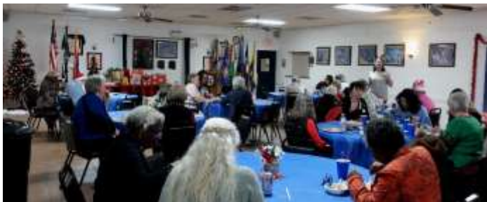
Unit 155 members and guests enjoy being together at their Christmas party. Names were not provided.

Most recently, we held our annual Christmas party at the local VFW post (our regular meeting place) with a great turnout including several WACVA members.