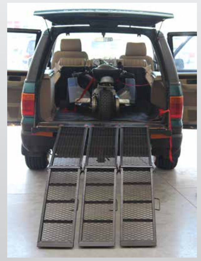
For more information on the above products see our website at: