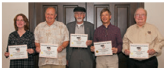
Assessors Received Certificates.