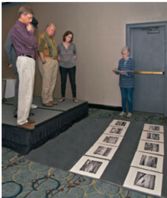
Print Portfolio Assessment.