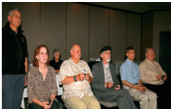
Digital Portfolio Assessment.