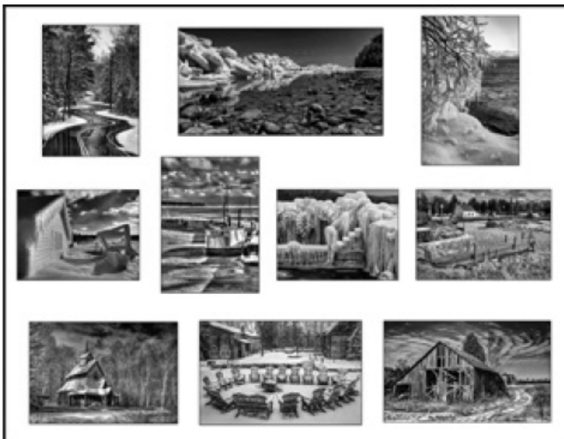
Overview Image: Winter in Door County, Wisconsin

During the image processing, I used different modes of false color photography and techniques of overlapping. The goal was to keep the reference to the original, individual photos as apparent as possible, in such a way, that the architecture or view of the original building is still recognizable.