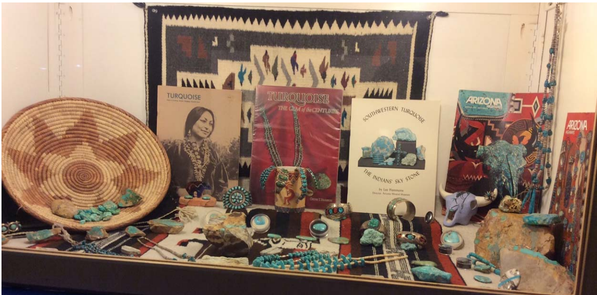
Rob Stapp's Turquoise