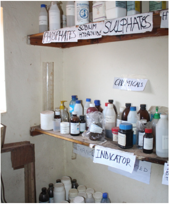
Existing cramped science lab