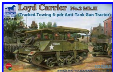
Bronco Loyd Carrier No. 2, Mk II (Tracked Tractor), # CB35188, towing a Riich British Ordnance QF Mk. IV A-T Gun 6 Pdr, # 35042 http://www.track-link.com/forums/site_blogs/22053