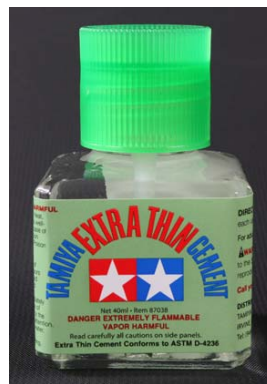
Tamiya Super Thin Cement "Green"

3. I use a point of a #10 blade or even one of fine points of tweezers to pick up one of the hex pieces, by "wetting" the tip with my tongue, and then touching it to the top of the hex piece. If the #10 blade is brand new, you can lightly touch its tip to the hex piece and it will pick it up.