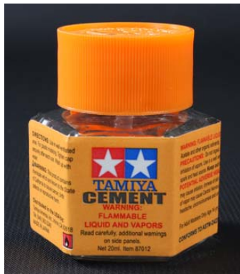
Tamiya Cement "Orange"

2. I place a tiny amount of Tamiya Cement "Orange" ( http://www.tamiyausa.com/items/paints-finishes-60/finishing-supplies-62000/plastic-cement-20ml-87012 ) where I want the Hex Bolt located. This is a thicker liquid solvent and gives you some time for placing the part. I use the end of a tooth pick, a piece of wire or the tip of a fine pair of tweezers to pick up a dab of glue and place it where I want it on the model.