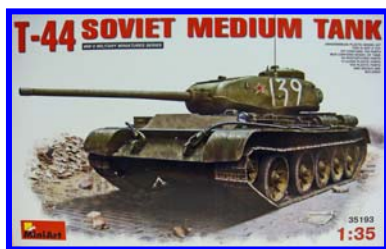
MiniArt T-44 Soviet Medium Tank, Kit # 35193 http://www.track-link.com/forums/site_blogs/27686