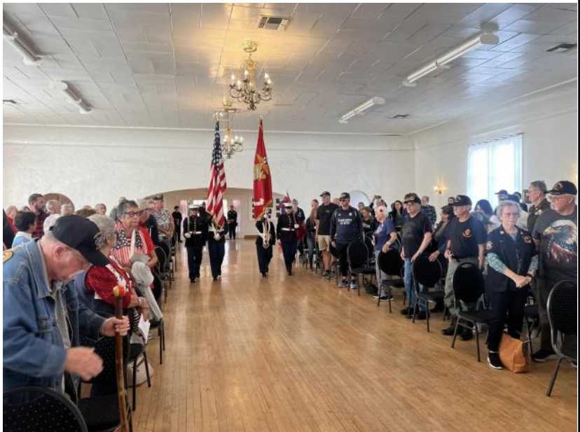
The Veterans Day Ceremony & Open House on November 11, co-sponsored by American Legion Post 132 and Orange Elks Lodge 1475.

We also had a great Veterans Day Ceremony and Open House on November 11, which was co-sponsored by our Post and Orange Elks Lodge 1475. Thanks to the volunteers from the American Legion families and the Elks for their efforts in putting on this great event.