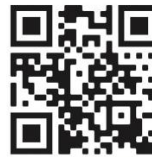
Operation Santa Claus

Please make checks payable to either Operation Santa Claus or Senior Santa and Friends.