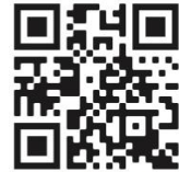
Senior Santa and Friends