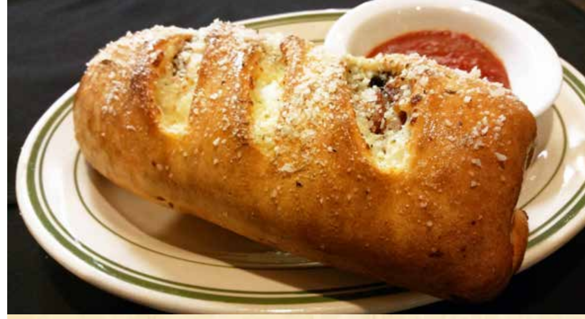
Ultimate Combo Stromboli