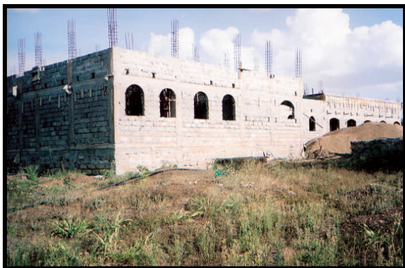
1st Floor of MCDC Kitchen/Dining Hall

The new MCDC campus construction is steadily progressing. I've included some pictures of the first two floors of the dormitory (for 160 orphans to live in) and of the \pm 8,000 sq.ft. kitchen dining hall (1st floor) which is designed to feed 550 kids at each meal. The compound wall is complete and 3-Phase power is on-site. When more money is raised, the first 10 of 15 class rooms will be built on the adjacent one-half acre of ground David Wilkerson bought for MCDC. Please continue to pray for money to come in to keep the construction going. The kids desperately need it ASAP.