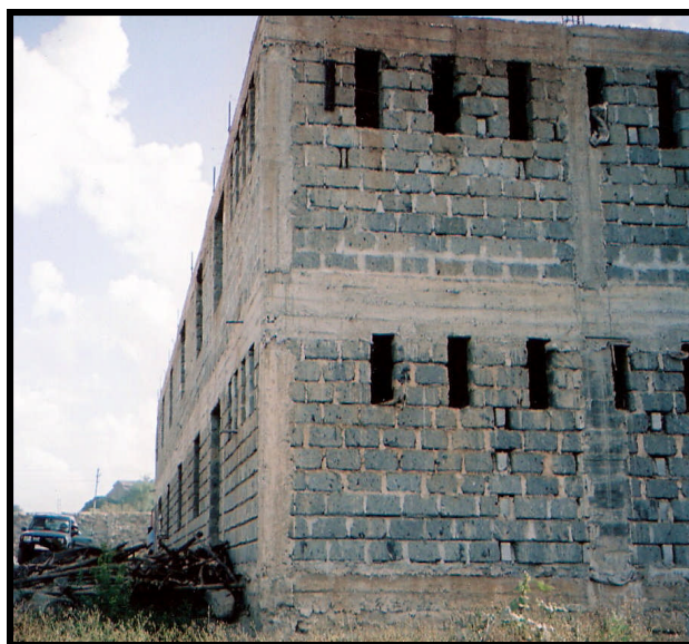
1st & 2nd Floors of Dormitory