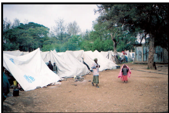
Life in the Refugee Camp

I've never seen anything like them. Imagine having fled your home, farm, livestock and all your possessions, your life's work. Many having their homes burned while fleeing for their lives. Many didn't make it and were killed. Many had terrible scars from being hacked with machetes. It was heartbreaking. Even churches have been split among tribal lines. It was widespread and at one time we were within 10 miles of the Uganda border.