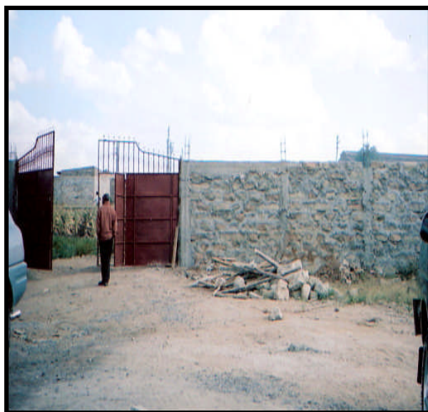
MCDC Compound Wall & Entry

These kids are growing up fast. The first 12 have graduated from high school and 80 are in various grades K-12. Your generous contributions have given them hope in Jesus and a chance at Life. May God richly bless you for your giving.