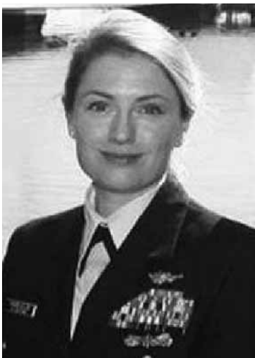
Assistant Director, Office of Legislative Affairs, Department of Homeland Security