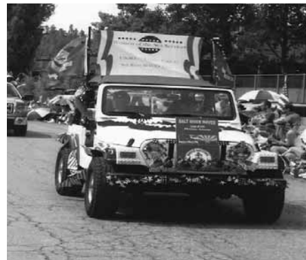
Salt River WAVES parade entry, Munds Park, AZ on July 4, 2014.