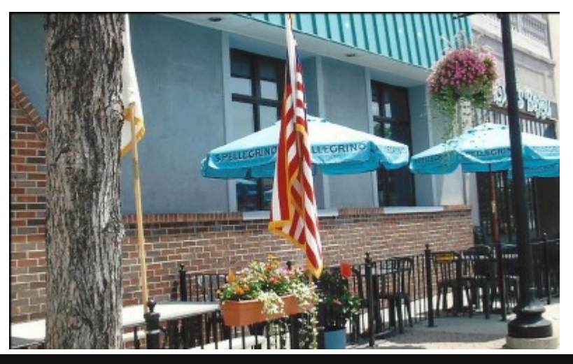
Patios Open Come enjoy the Memorial Day Parade this Year!