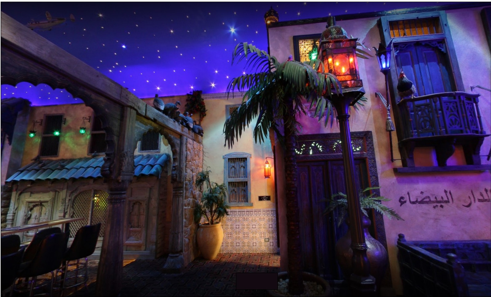
The new Casablanca Auditorium features 11 Moroccan building facades with 1100 fiberoptic stars above.

well. Fortunately, research shows the movie industry is recession-proof.” “It didn’t take us long to surpass the annual attendance to Chicago Bears attendance at Soldier Field.”