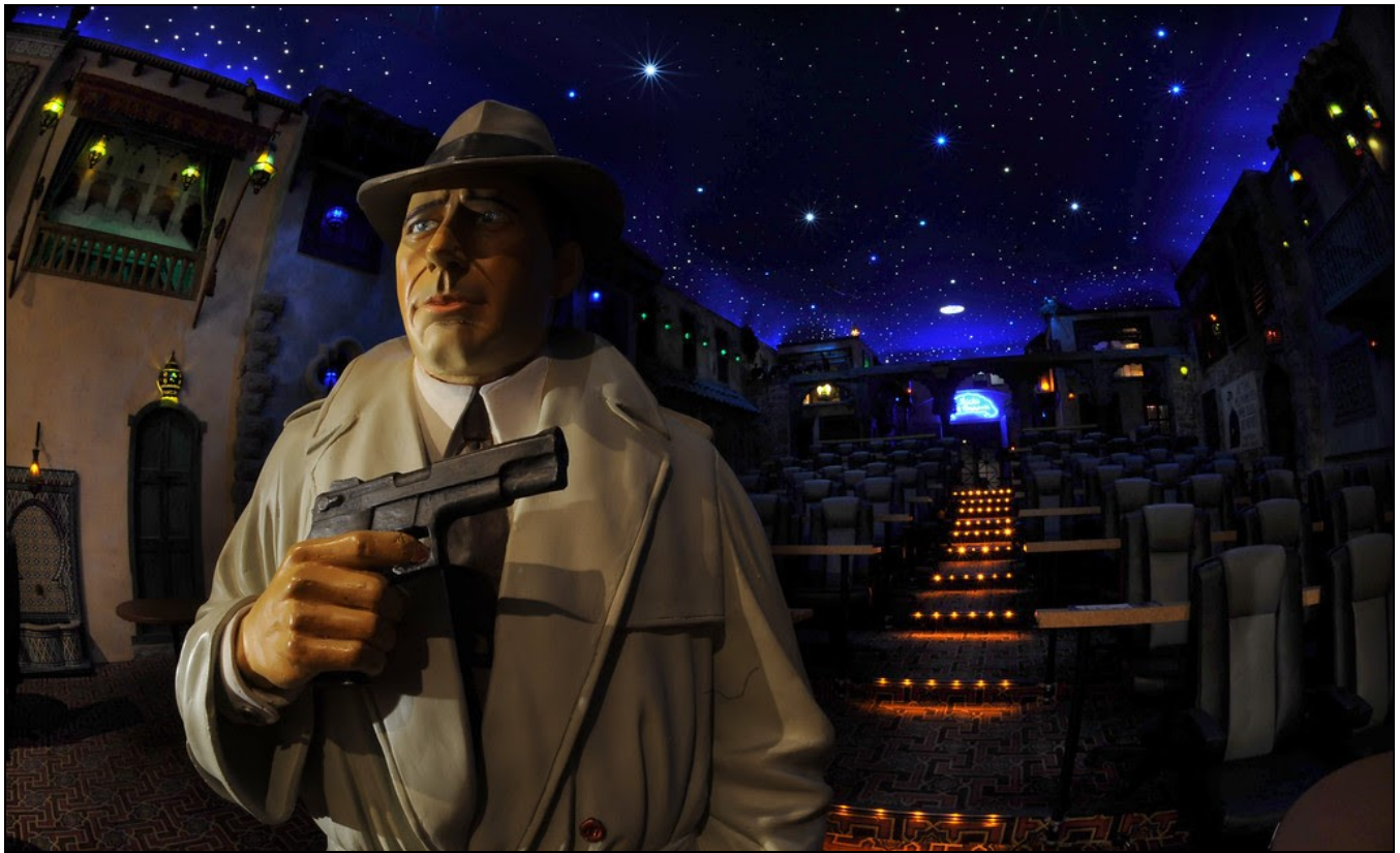
A statute of Rick greets the patrons at the entrance of the new Casablanca Auditorium.