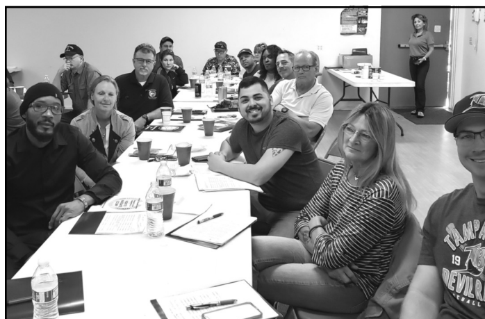
Pictured above are the Stewards who attended a District II Training Seminar on February 23rd: