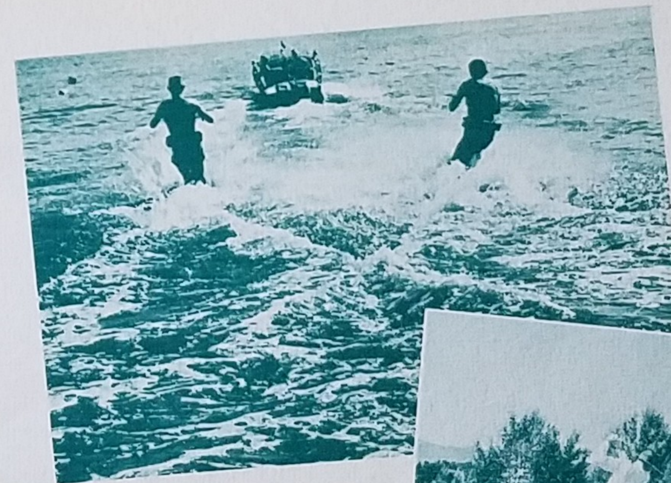
Water Skiing, Motor Boating and Fishing at Cherry Creek Reservoir!