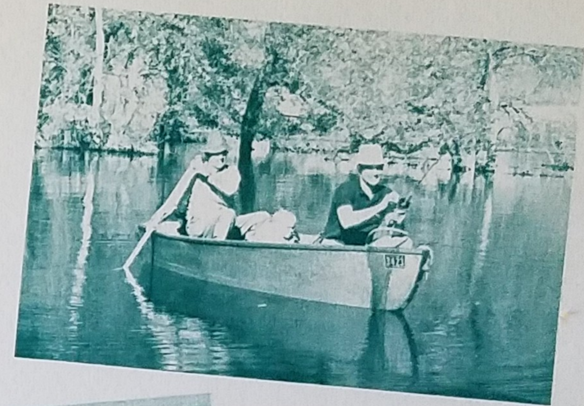
Recreational Facilities in your immediate area

BEFORE YOU BUY OR BUILD investigate thoroughly the advantages of a homesite in Southmoor Park. Study the map on the inside of this folder. See how curving streets provide unusual landscaping possibilities and at the same time increase traffic visibility. No unsightly alleys mar the district. Back yards can be made into secluded gardens with a maximum of privacy. New, moderately priced homesites offer high hilltop locations with unobstructed mountain views. One of them may be the exact spot you have looked for.