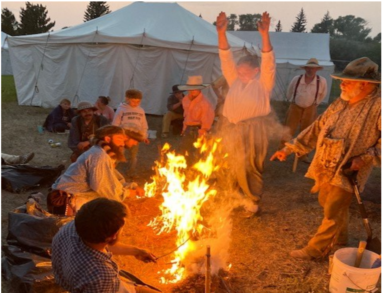
Fire starting competition starts at dusk