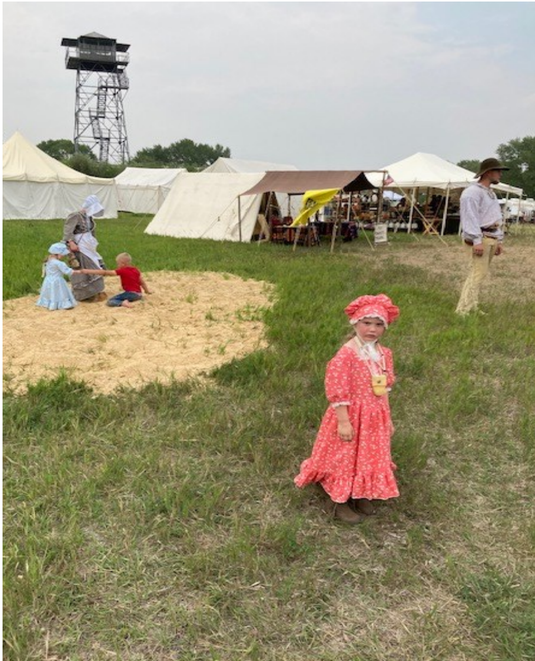
Rendezvous site with fire watch tower and kid's sawdust pile loaded with beads, coins, etc..