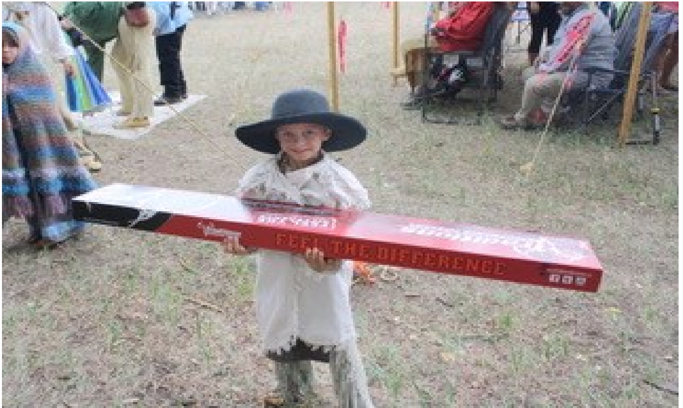
Future mountain man and proud winner of a new muzzle loading rifle