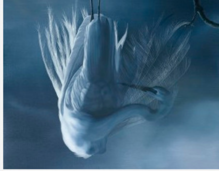
Carin Wagner, (Palm Beach Gardens) "Upside Down" 2014