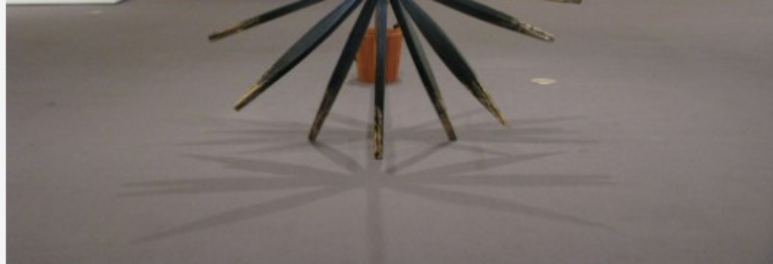
Jack King, (Tampa) "No Fixed Plan for Arriving: Black Swan"

Upon entering the exhibition the first thing you will notice is open space. Nguyen's curatorial decision, to choose only 69 peices from 52 artists for this exhibition, resulted in generous latitude for each work of art, to coexist within the Museums boundaries.