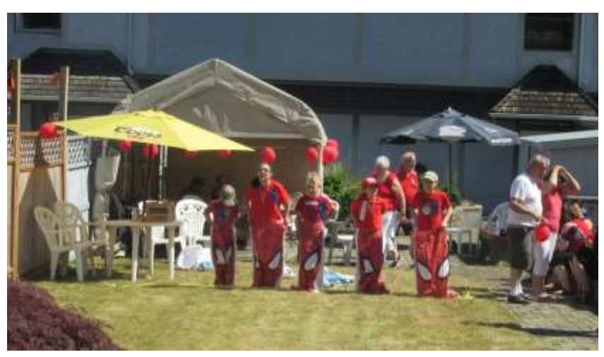
This is what it's all about, children having fun at the Bike Parade and Sack Races