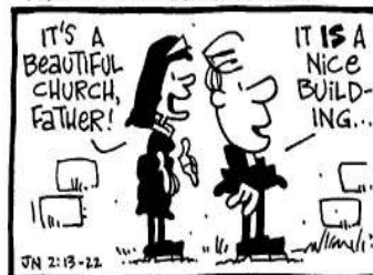
DEDICATION OF ST. JOHN LATERAN

Altar Server Training will be held in the church on Wednesday, November 16, from 6:45-8:00 pm. Anyone new in SOR grades 5 and older, adults, fathers and sons, mothers and daughters or anyone just wanting a refresher session is invited to attend. Scheduling forms for new altar servers will be handed out at the training. Come on November 16th to learn more.