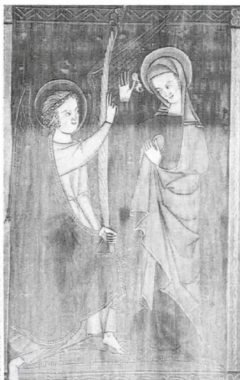
THE ANNUNCIATION / PISALTER, VENICE

P erhaps God has already spoken to you! In the great calls in Scripture, God doesn't seem to care about age. God doesn't care about gender, race, talents, poverty or wealth, strengths or weaknesses. God calls each of us because we are God's daughters and sons. God's call is personal (to you and no other!), and this call is to always be Christian and serve the Lord. Most often