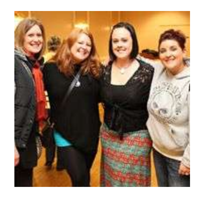
Guest & Members enjoying some fun at the Crab Feed!