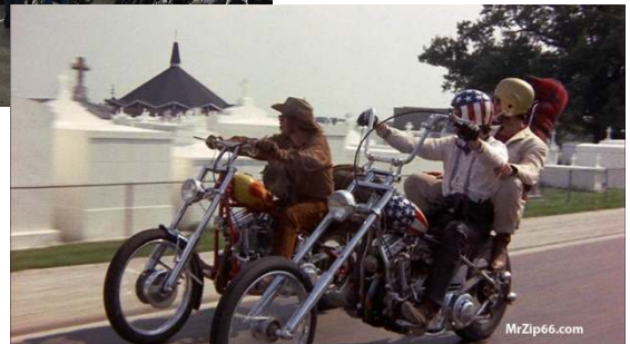
The "Easy Rider" picture above shows the graveyard and the church steeple.

The run included a lunch stop at N.O. Style Po-Boys, 3874 Hwy 1, Raceland, LA 70394.