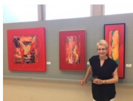
SAMPLES OF HER STUDENT'S WORK