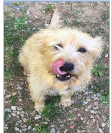
Nilla – Heartworm Positive