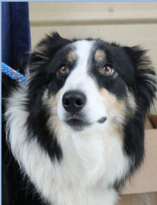
Trixie – Heartworm Positive