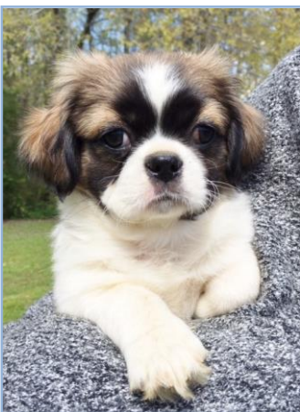
Tucker – Heart Murmur

So, you see what we're up against. This is neither the first nor the last time that we will have dogs in need of greater medical care; however, we rarely have so many at the same time. And these treatments are all done prior to putting them up for adoption; the adopters do not pay for any of these. The adoption fee is not raised because of this.