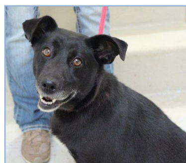
Pumpkin - Heartworm Positive