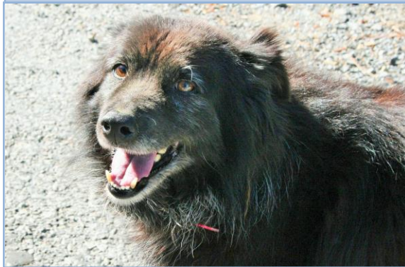
Hope – Heartworm Positive