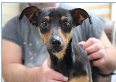
BoJo - Heartworm Positive