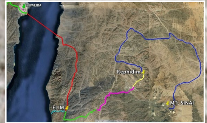
The Journey Route to Mt. Sinai